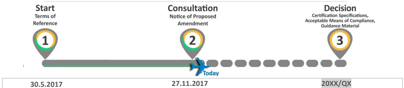
● EASA rulemaking process milestones