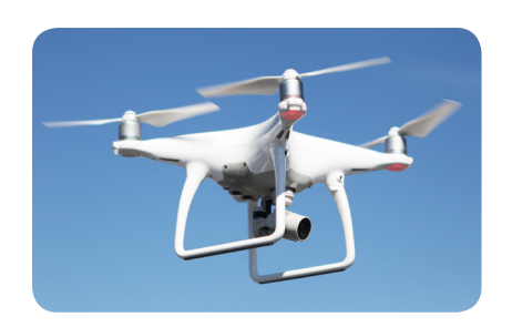
Figure C: Categories of drone operations specified by the European rules on drones.

The manual for "Drone Incident Management at Aerodromes" seeks to mitigate risks from unauthorised civilian drones with a take-off mass up to 25 kg<sup>22</sup>. Such drones are normally permitted to be operated in the "open category"<sup>23</sup>. When operated away from protected installations maintaining visual contact between the drone pilot and drone and flown below 120m height, the operational risk under the "open category" is usually considered so low, that no prior authorisation is required before starting the flight.