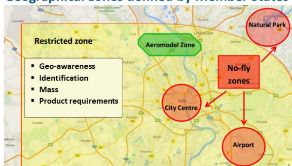
Geo-awareness on drones to support remote pilots