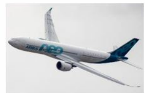
International IFR flights

This definition includes all types of aircraft without a pilot on board, including radio-controlled flying models (powered fixed wing, helicopters, gliders) whether they have an on-board camera or not.