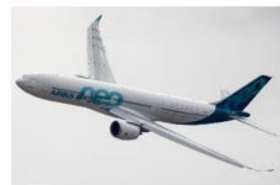
International IFR flights

This definition includes all types of aircraft without a pilot on board, including radio-controlled flying models (powered fixed wing, helicopters, gliders) whether they have an on-board camera or not.