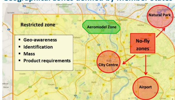
Geo-awareness on drones to support remote pilots

Each EASA Member State will determine drone geographical zones, which are areas where drones may not fly (e.g. national parks, city centres or near airports) or may fly only under certain conditions, or where they need a flight authorisation. Therefore, it is important for you to consult your National Aviation Authority to check where you can and cannot fly your drone.