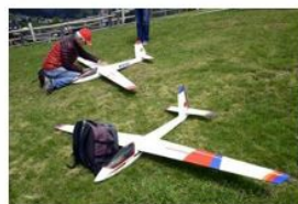
Leisure flights, including with model aircraft