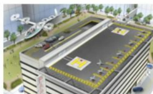
Urban air mobility