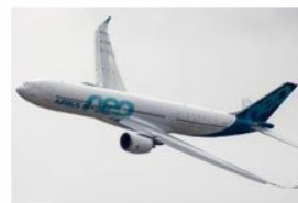
International IFR flights

This definition includes all types of aircraft without a pilot on board, including radio-controlled flying models (powered fixed wing, helicopters, gliders) whether they have an on-board camera or not.