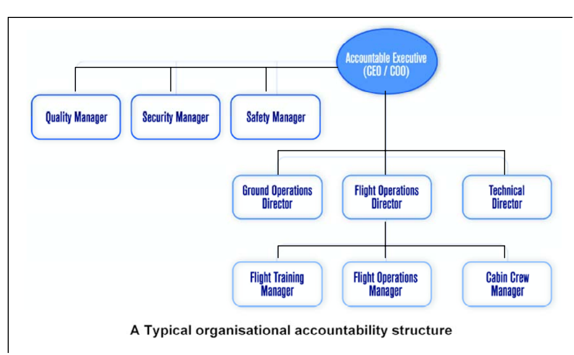
Figure 3: IATA Integrated Airline Management System