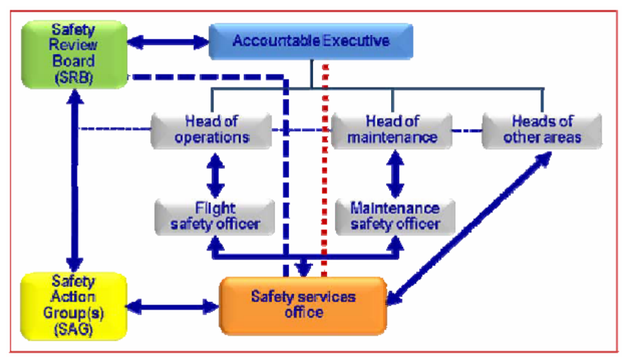
Figure 2: ICAO SMM – Second Edition 2008