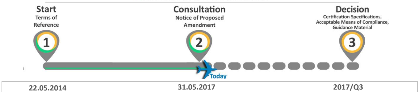
● EASA rulemaking process milestones