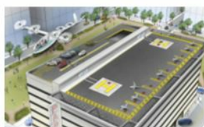
Urban air mobility